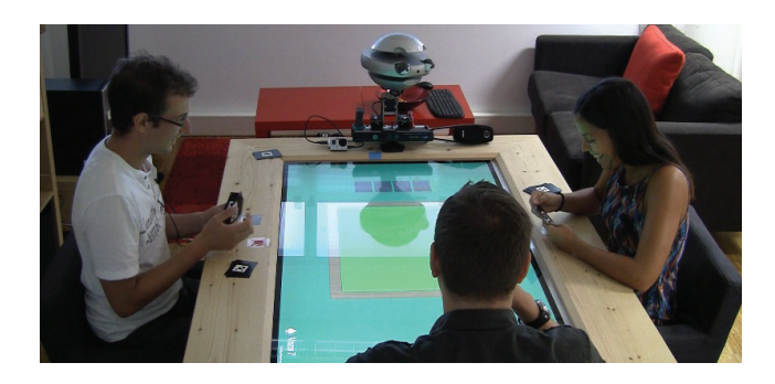
Figure 2: Example of a card game session with EMYS.

sidering the theoretical complexity of the construct.