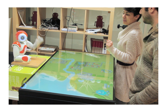
Fig. 2. Robotic tutor playing Enercities with students