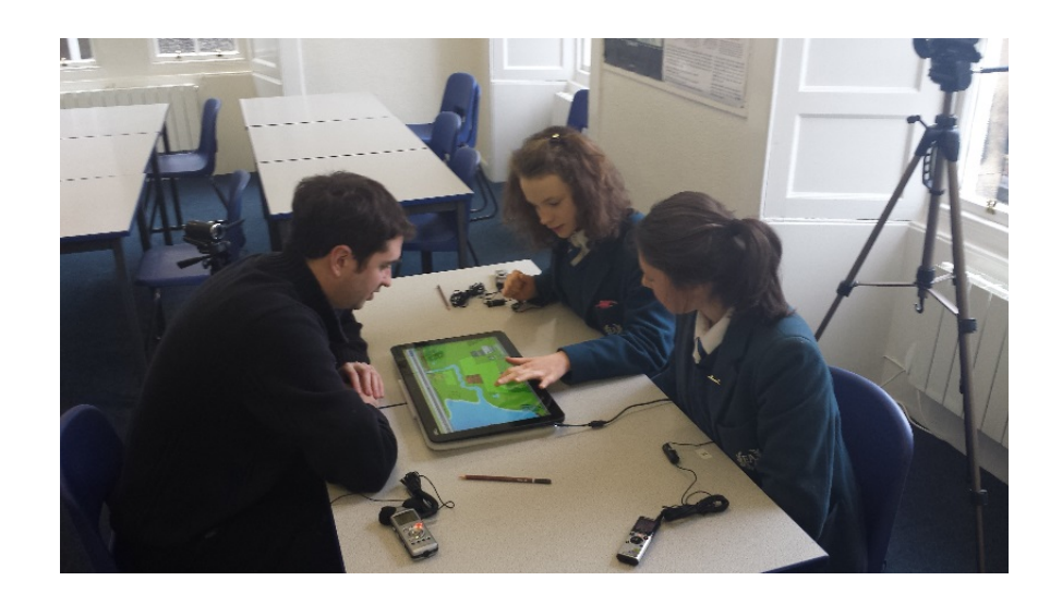
Fig. 4. Teacher playing Enercities with 2 students