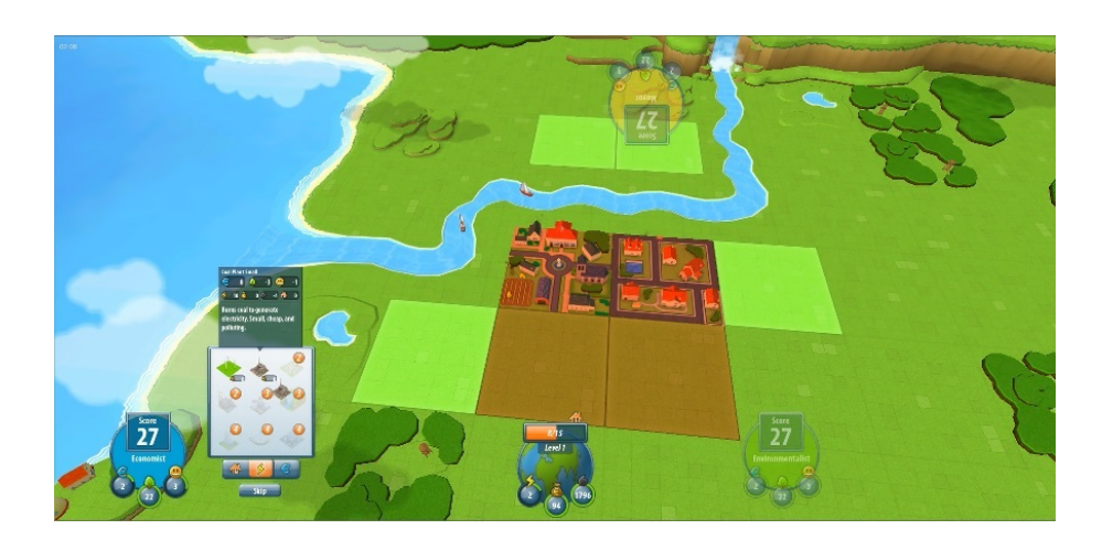
Fig. 1. Screenshot of Enercities game

Intelligent Energy Europe and this project reports that this serious game made students aware of energy expenditure, among others [16]. Schools across Europe have already used Enercities in their curriculum and this game was therefore chosen as the basis of our collaborative scenario. Within the EMOTE project, the original online single player game was adapted to a multiplayer version where participants interact by using a multi-touch table or a tablet. This was done to stimulate collaborative learning [17], [4].